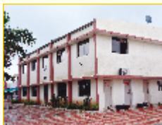
DINING & YOGA