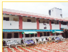
GENERAL & SPECIAL